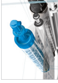
Cooling cylinder 13