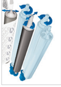
Roller pre-wash-up system 04, 05, 06