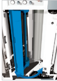
Fume exhausting unit