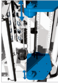
Shaft-less unwinds and rewind 01, 02, 03