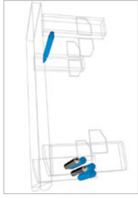
Temperature control system 04, 06, 08