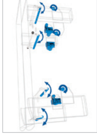
Tension control system 10