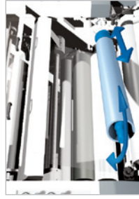
Sleeved transfer roller 05